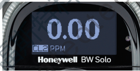
Easy to read