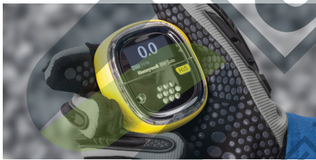
Easy to handle