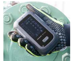
Designed for your hands, with or without gloves..

Unlike gas detectors that you wear, the Honeywell BW™ Ultra is a detector that you hold as you sample the air in a confined space. That's why we designed the Honeywell BW™ Ultra to fit the shape of your hand – with a comfortable weight and a slimmer profile than other five-gas detectors – to prevent fatigue and increase productivity.