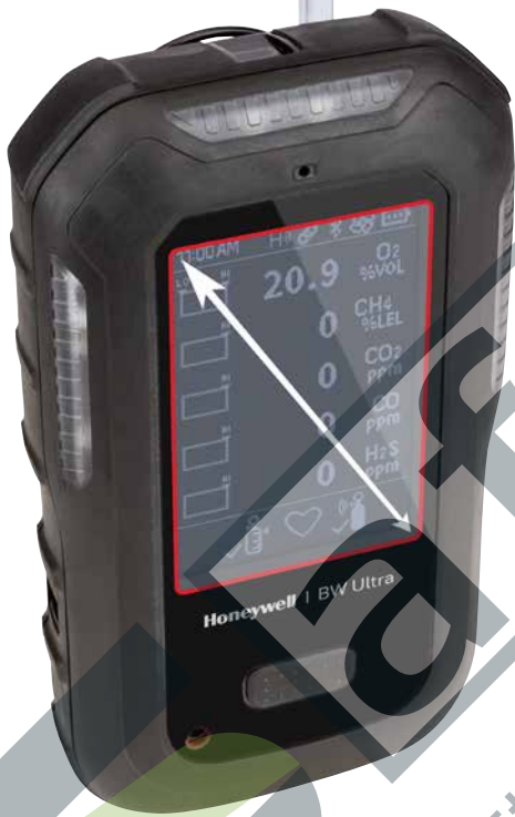
Large dot matrix LCD screen for easy viewing