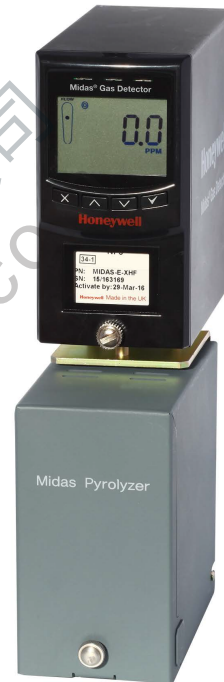
Midas Gas Detector with Midas Pyrolyzer