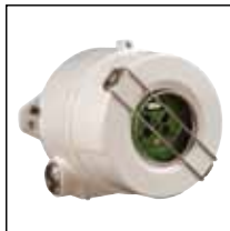
Multi-Spectrum UV/Dual IR/VIS Fire and Flame Detector

PROOF Revised by HA Marcomms Poole Please review content carefully and provide feedback Proof No: 1 Time/Date: 01-03-12