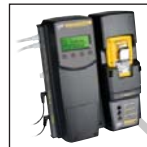
MicroDock II compatible